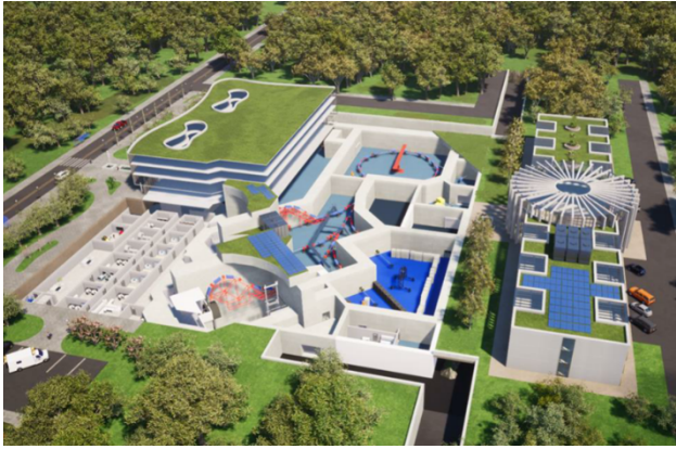
Figure 1: General 3D view of the SEEIIST facility

Figure 1 shows a 3D view of the overall facility, with the position of the clinical section connected to the treatment rooms, the accelerator bunker in the middle (with the roof open to see the accelerator components), and the experimental building to the right.